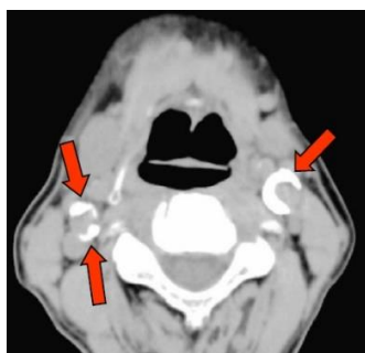
Figure 1. Observation of the carotid artery calcification. Arrow tip indicates the calcification.

CAC was detected on the axial CT images captured by using the multislice CT system Activation 16 (Canon Medical Systems, Tochigi, Japan) at the Matsumoto Dental University Hospital. The presence of CAC near the bifurcation of the common carotid artery (about 2-cm upper and lower) was evaluated independently by two oral and maxillofacial diplomate radiologists (one with > 20 years of experience and another with 30 years of experience; Figure 1). In case of different outcomes (such as ectopic calcifications) between the two oral and maxillofacial radiologists, a consensus was reached via discussion.