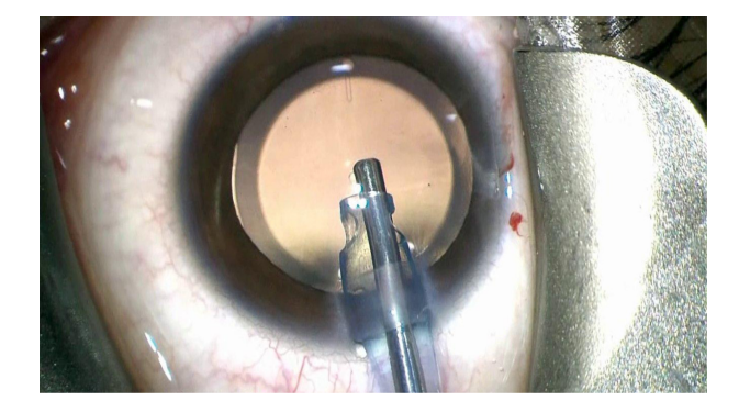
Figure I Figure showing aspiration of OVD using a coaxial irrigation aspiration probe directed toward the central hole of the Visian STAAR ICL. Abbreviations: ICL, implantable collamer lens; OVD, ocular viscosurgical device.

All surgeries were performed by a single experienced surgeon (SG) under topical anesthesia. The surgical steps from temporal 2.8 mm clear corneal wound creation to insertion of ICL were similar in both the eyes. Total surgical time from the creation of the corneal wounds to hydration of the same was recorded in minutes. After the insertion of footplates of ICL into the ciliary sulcus, time taken for complete removal of OVD from the anterior chamber was noted. Aspiration was performed with automated I/A coaxial probe with a flow rate of 60 cm<sup>3</sup>/min and vacuum of 600 mmHg in both the groups. The aspiration port was directed toward the central hole (Figure 1). In the HPMC