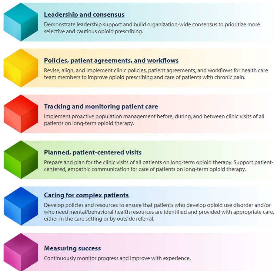
Fig. 1 Six Building Blocks: a team-based approach to improving opioid management in primary care.

This study employs a hybrid type III implementation-effectiveness design [17]. It uses mixed methods, collecting both quantitative and qualitative data from primary and secondary data sources. Data will be collected prospectively at multiple time points over the 24-month study period. The first 6 months of the study were dedicated to developing, testing, and refining the 6BBs how-to-guide (Clinic Implementation Guide); months 7–21 will involve 6BBs implementation, including the use of the Clinic Implementation Guide and data collection activities; and the last 4 months will entail data analysis, final modifications to the 6BBs Clinic Implementation Guide for widespread dissemination, and reporting of findings.