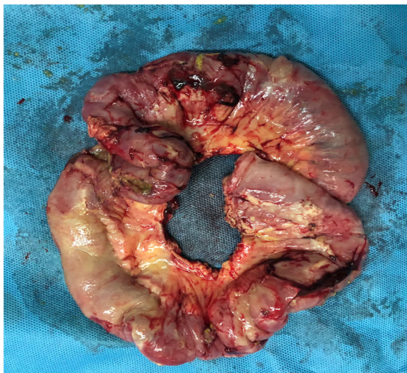
Fig. 1 Gross view of the necrotic small bowel: 33 cm of which the largest perforation hole was in the middle

In fact, the small intestinal mucosa is very susceptible to warm ischemia even after short duration. Gastrointestinal perforation, abscess formation and sepsis resulting from thermal injury were reported in percutaneous