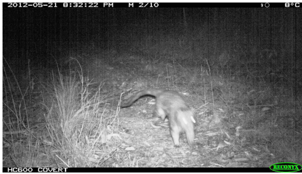
Figure 4. Spotted-tailed quolls ( Dasyurus maculatus ) often moved too fast on trails to accurately determine their behavioral responses to the camera traps.

Feral cats often approached camera traps, so much so that camera traps might have acted as a lure. At Green Gully, an adult cat and three kittens all approached the trap after first trigger and stood looking at it while it photographed them. Feral cats were also photographed spraying (scent marking) the camera post. At one site, a cat jumped on top of the camera trap and then jumped down in front of it and sprayed several times.