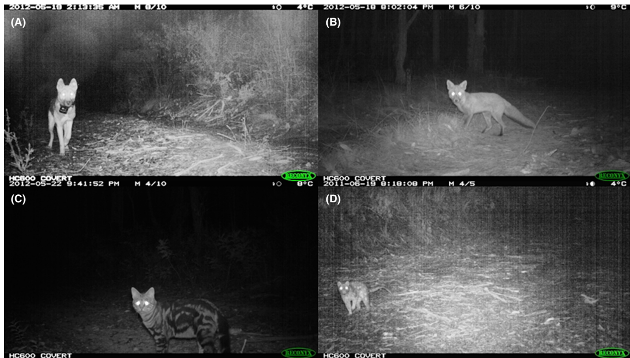
Figure 2. Example nighttime responses of four predators to camera traps with infrared flash. (A) wild dog (with a GPS telemetry collar and an ear tag) looking at and approaching the camera trap, (B) fox displaying a startled response, (C) feral cat staring at the camera trap, and (D) spotted-tailed quoll looking at and approaching a camera trap.

tors either appeared in front of the camera trap without a determinable entry direction or came from the side.