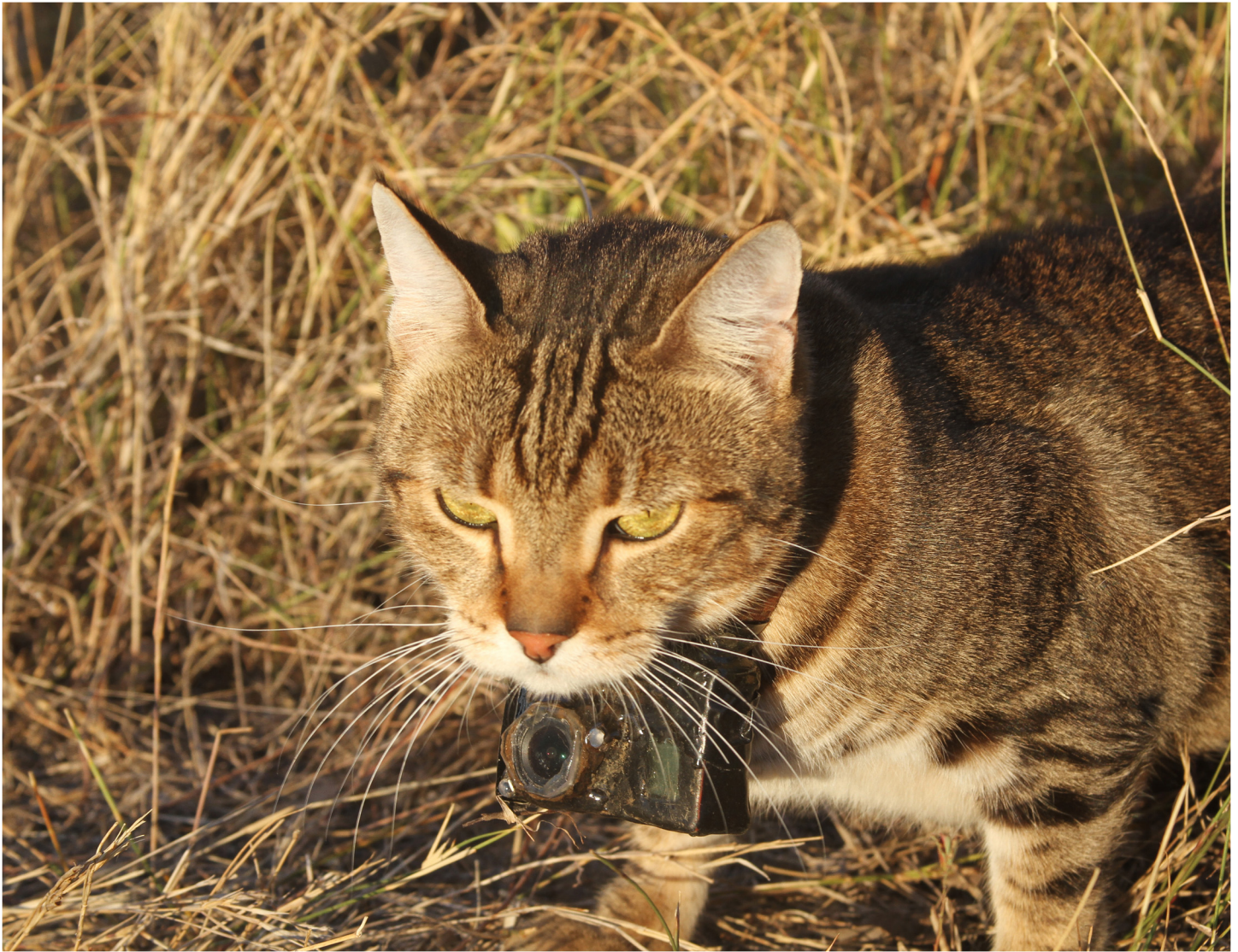
Fig 1. Photo of feral cat carrying the largest camera-collar used during this study.