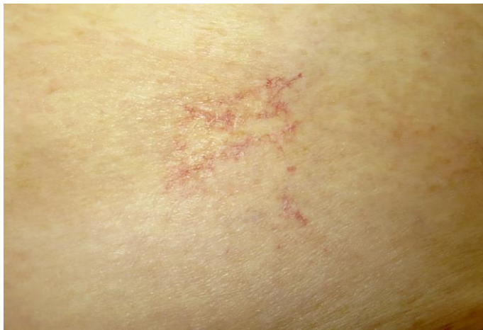
Fig. 1. The patient had a reddish pigmentation left at the spot similar to this one. She had also received radium treatment for haemangioma at this site on the lower part of her abdomen.