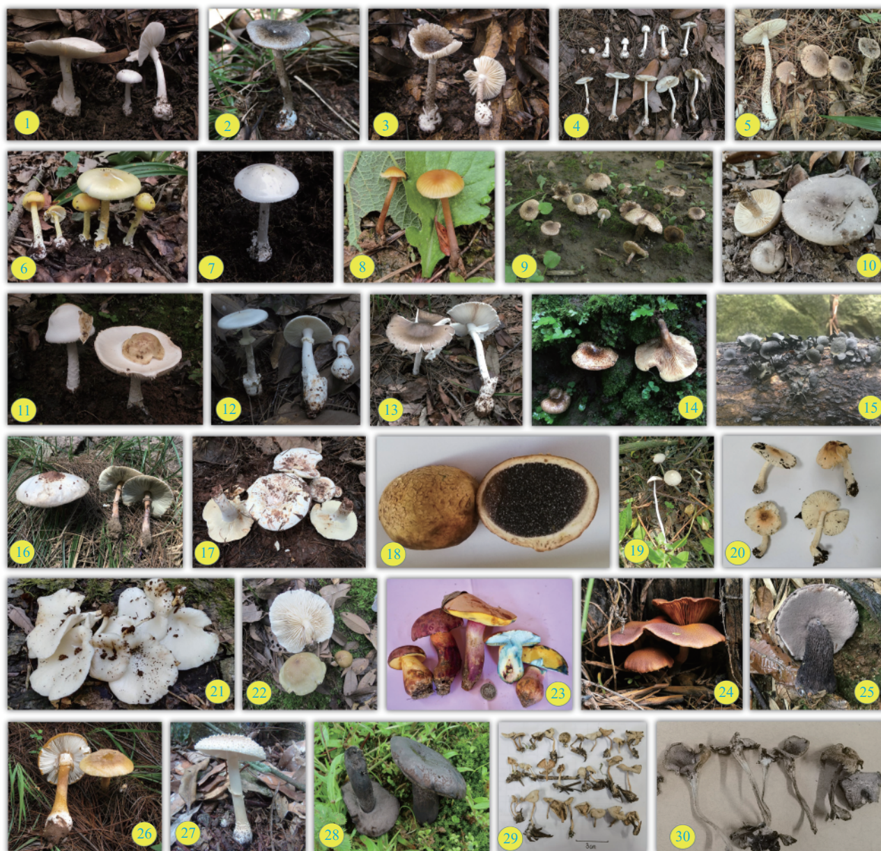
FIGURE 2. Poisonous mushrooms identified from mushroom poisoning incidents in China in 2022.

Note: 1: Amanita exitialis ; 2: A. fuliginea ; 3: A. fuligineoides ; 4: A. rimosa ; 5: A. subfuliginea (provided by Yalin Zhou); 6: A. subjunquillea ; 7: A. pallidorosea ; 8: Galerina sulciiceps ; 9: Lepiota brunneoincarnata ; 10: Russula subnigricans ; 11: A. neoovoidea ; 12: A. oberwinklerana ; 13: A. pseudoporphyria ; 14: Paxillus orientalis ; 15: Cordierites frondosus ; 16: Chlorophyllum molybdites ; 17: Russula japonica ; 18: Scleroderma cepa (provided by Tianhong Li); 19: Coprinopsis aesontiensis (provided by Wensong Chen); 20: Leucoagaricus purpureoillacinus species complex (provided by Xia Rong); 21: Omphalotus yunnanensis nom. prov.; 22: Tricholoma olivaceum ; 23: Lanmaoa asiatica (provided by Guanliang Wen); 24: Gymnopilus dilepis (provided by Ya'an CDC); 25: Anthracoporus nigropurpureus ; 26: Amanita rufoferruginea ; 27: A. sychnopyramis f. subannulata (provided by Zuohong Chen); 28: Anthracoporus holophaeus (provided by Yanchun Li); 29: Collybia humida nom. prov.; 30: Spodocybe venenata nom. prov.