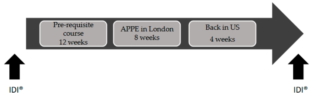
Figure 1. Instructional assessment plan. Before departing to London for their international APPE rotation, students complete a 12-week pre-requisite course. The students took the IDI prior to the pre-requisite course and again four weeks after returning to United States.

after APPE completion (Figure 1) [27]. To identify examples of changes in knowledge, skills, and attitudes, student course feedback and survey responses were reviewed by the authors.