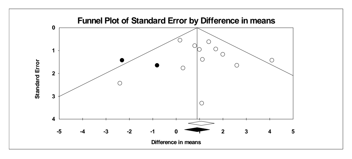
Figure 3. Funnel plot observed and imputed values from Duval and Tweedie's trim and fill.