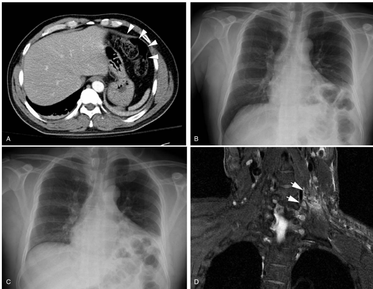
Figure 2. (A). Abdominal CT scan demonstrated displacement of colon to left upper quadrant (white arrowheads). (B and C). Paired inspiratory and expiratory CXRs. (D). Coronal T2-weighted MRI showed hyperintensity (white arrows) of C5-C6 nerve roots. MRI = magnetic resonance imaging.

C), raising suspicion of DP secondary to phrenic nerve palsy. Furthermore, the brachial plexus magnetic resonance imaging showed left C5 and C6 root avulsion injuries (Fig. 2D). A diagnosis of brachial plexus injury, occurring concurrently with