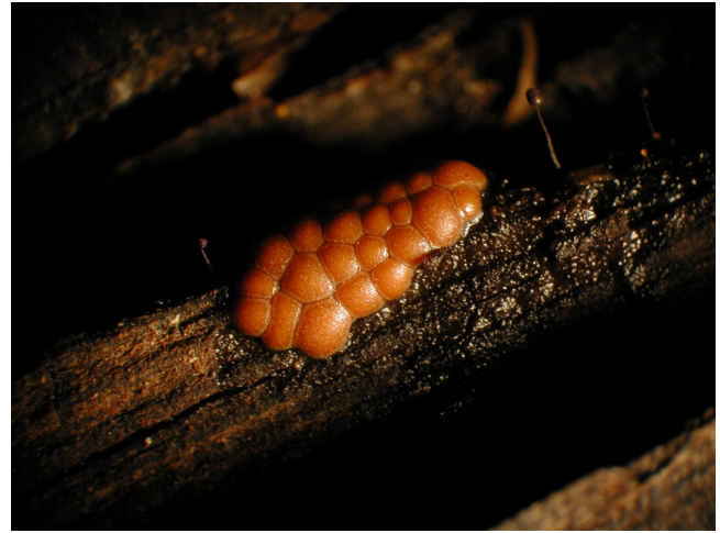
FIGURE 5 Perichaena quadrata sessile sporangia growing in MC culture.

Bark pH is one factor that influences the presence, growth, and development of corticolous myxomycetes and fungi in MCs (Snell and Keller, 2003; Everhart et al., 2008; Scarborough et al., 2009; Kilgore et al., 2009; Perry et al., 2020). Therefore, during live tree bark collection, collectors should be aware that pH ranges and assemblages of acidophilic, neutrophilic, and basophilic myxomycete species associated with live tree species bark and woody vines increase the chances of finding a more diverse group of myxomycete species (Everhart et al., 2008, 2009; Kilgore et al., 2009; Scarborough et al., 2009). For example, Cercis