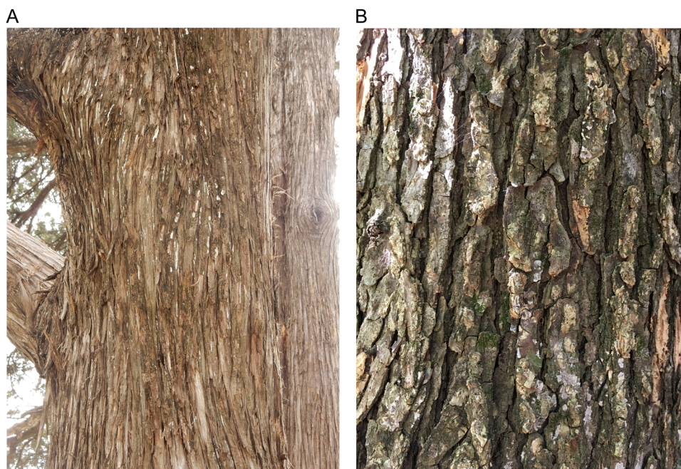
FIGURE 6 Rough bark surface characteristics of live (A) Juniperus virginiana and (B) Ulmus americana trees.

a Alkaliphilic pH rank ordered (7.1–7.9).