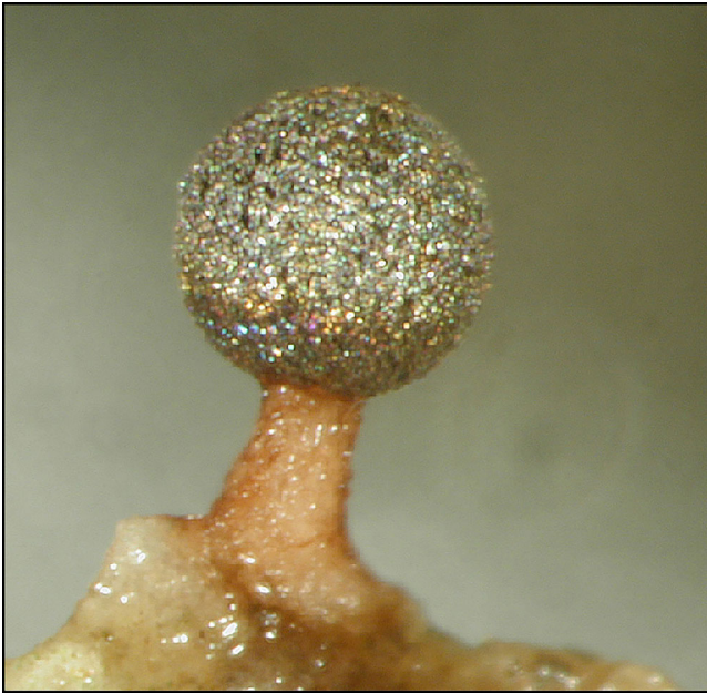
FIGURE 4 A stalked Diachea arboricola sporangium harvested from a MC. Note silvery iridescent peridial surface; additional developmental stages and scanning electron microscope images of this species are available in its original publication (Keller et al., 2004). This species was found on trunk bark of live Quercus alba and Juniperus virginiana trees.