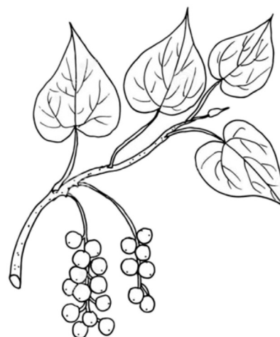
Fig. 3. Guduchi ( Tinospora cordifolia Willd.)

A.C.S in the plasma to influence a stronger regression and better survival. And unlike the earlier positive studies with extracts, the whole urine used in the experiment may not contain sufficient quantities of A.C.S.