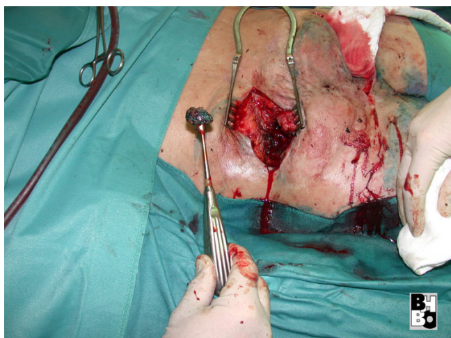
Figure 4 Sequestrectomy after methylene blue dye injection into the sacral fistulas.

After ensuring sufficient dorsal drainage a gastrograffin enema was performed to determine the site of a possible