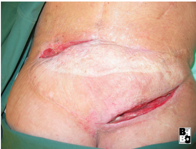
Figure 6 Latissimus dorsi free flap with fistula.

Polymeric biguanide-hydrochloride (Lavasept®, Fresenius Kabi AG, Bad Homburg, Germany)