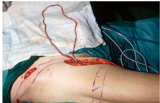
Figure 1 Saphenous vein graft anastomosed end-to-side to the superficial femoral artery (arterio-venous loop).

In 2004 the patient presented with a recurrent inguinal hernia on the left side outside of our sarcoma center. The Shouldice repair of his hernia was uneventful. Three weeks after the operation hematological laboratory findings and blood chemistry values showed signs of infection. A CT-scan of the abdomen and pelvis showed a massive inflammatory infiltrate with air trapping contiguous to a large abscess in the right iliacal muscle (7 × 5 cm) and a collateral infiltrate of the psoas muscle. Addition-