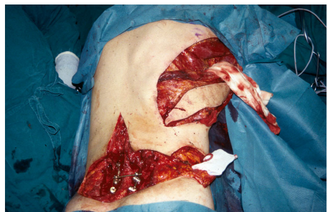
Figure 2 Latissimus dorsi free flap with the superficial femoral artery (arterio-venous loop) at the bottom right corner and an implanted Universal Spine System with fixation at the arcus root of L4, L5 and the lateral mass of the sacrum for stabilization at the bottom left corner.

ally extended osseous destructions of the sacrum were documented. To differentiate between postoperative defects, the previously diagnosed sequestering chronic osteomyelitis or a possible relapse of his chondrosarcoma was hardly possible (Fig 3). After antibiotic treatment of a urinary tract infection the patient developed an antibiotic-associated diarrhea. The patient was then referred to us for further therapy of his life threatening hematogenous dissemination of bacteria from his multiple abscesses. By the time of referral in addition to the previously described iliacal and psoas abscesses he had developed an active discharging praesternal/mediastinal abscess and bilateral intracarpal infections. The abscesses were surgically drained and a bacterial smear revealed