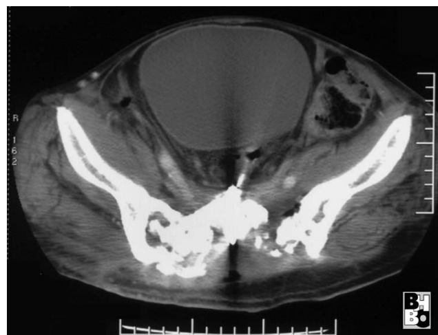
Figure 5 Gastrograffin enema showing a gastrointestinal perforation reaching to the sacral lacunae.

Universal Spine System (USS, Synthes, Inc., West Chester, PA)