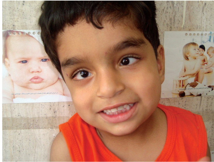
Figure 2. The 3.5 years old boy with bilateral abducens nerve palsy and developmental delay.

The brain MRI without contrast shows evidences of vermian dysgenesis and superior cerebellar peduncles representing the molar tooth midbrain-hindbrain