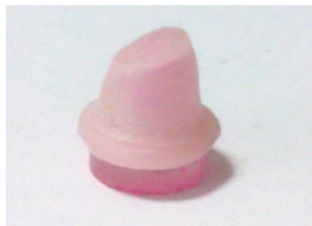
Fig. 2. IPS e.max coping on the respective die

Epoxy resin (Die Epoxy, American Dental Supply Inc., Allentown, PA, USA) was poured into the impression to create a pattern, which was used to fabricate copings. The thickness of copings was measured by a digital caliper (Iwanson decimal caliper 2550-2; ASA Dental, Bozzano, Italy). A die was scanned with a CAD scanner (Sirona Dental GmbH, Wals, Austria). The data were subsequently transferred to the CAM system to design 20 copings (10 copings per group). The coping margin thickness of 0.4 mm for group A and 0.7 mm for group B on a 35-micron die spacer were modeled by a single technician.