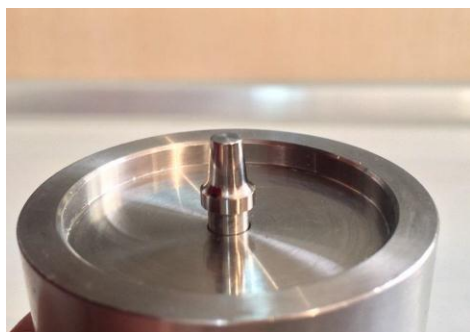
Fig. 1. Stainless steel die