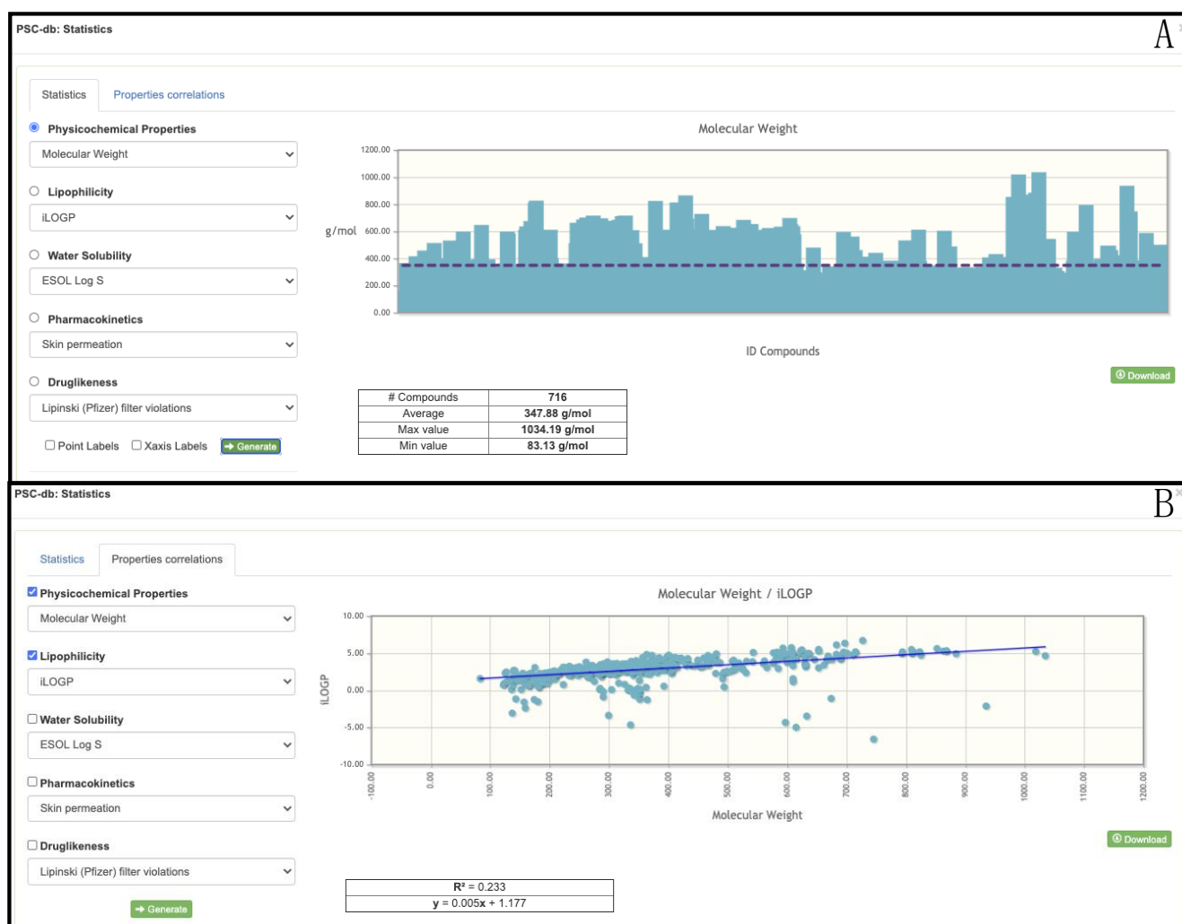
Figure 3. PSC statistics based on the calculated physicochemical and pharmaceutical properties. Statistics for the molecular weight (A) and the correlation between the molecular weight and the lipophilicity (B) of 716 selected alkaloids are shown.