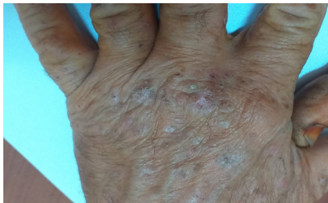
FIGURE 1 Erythematous squamous lesions on hands

Since 2006, the patient has been working in manufacturing of automotive rubber products. The substances used were elastomeric crumb rubber (particles or powder): (Natural rubber (NR), Styrene-butadiene rubber (SBR), Ethylene-propylene rubber (EPM and EPDM) or Nitrile rubber (NBR)); Additives for vulcanization (sulfur,