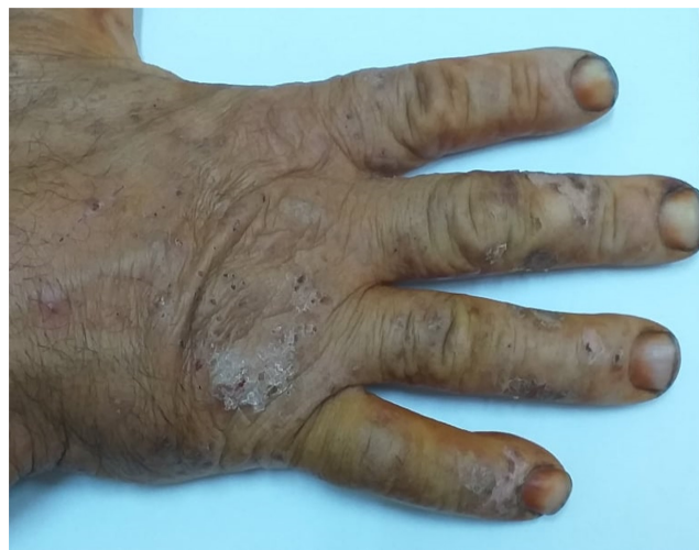
FIGURE 2 Erythematous squamous lesions on hands

The patient presented skin sensitization (defined as an immunological response to previous exposure to a substance which results in an inflammatory skin reaction) and had positive reactions to MCI/MI (2+) and MI (3+) when patch tested. Test positivity to MCI/MI and MI may represent two separate sensitizations due to a co-exposure since both of them were classified in the 1A category as skin sensitizers according to the Commission Regulation (EU) in 2018. 15 In addition, given chemical similarities between the isothiazolinone derivatives, cross-reactivity may be discussed too. In fact, several studies suggest that