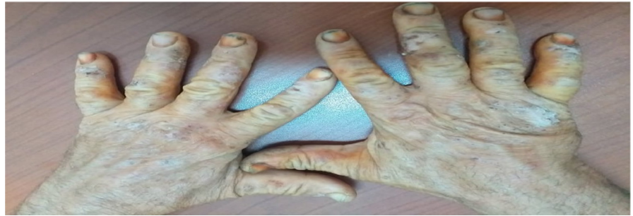
FIGURE 3 Erythematous lesions on hands

skin-sensitization to one of these allergens is likely to cause positive reaction to the other in the patch test. 16 According to Geirer et al, given immunological cross-reactions, the increase in primary sensitization to MI from 2009 to 2011 explained the rise in MCI/MI reactions. 17