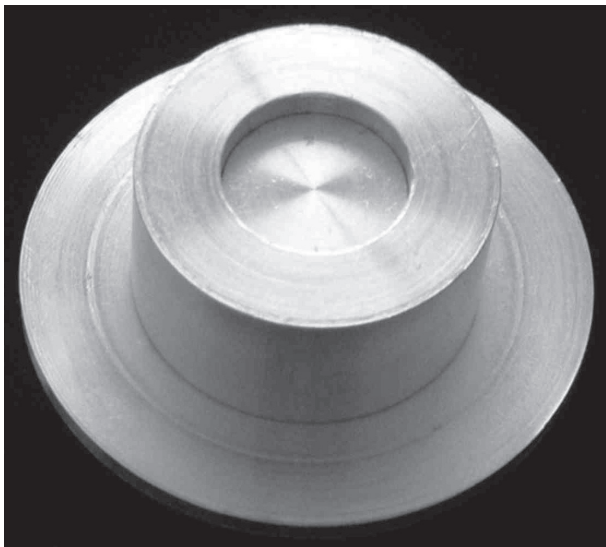
Figure 1- Metallic matrix with 15-mm diameter and 2-mm thickness

After final setting of the materials, silicone and stone plaster, the flasks were opened and the disks removed (Figure 2). The heat-polymerizing acrylic resins N1, N2 and N3 for artificial eyes (Clássico,