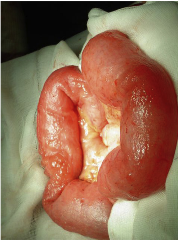
Fig. 1. Small bowel segment with bubble of air.