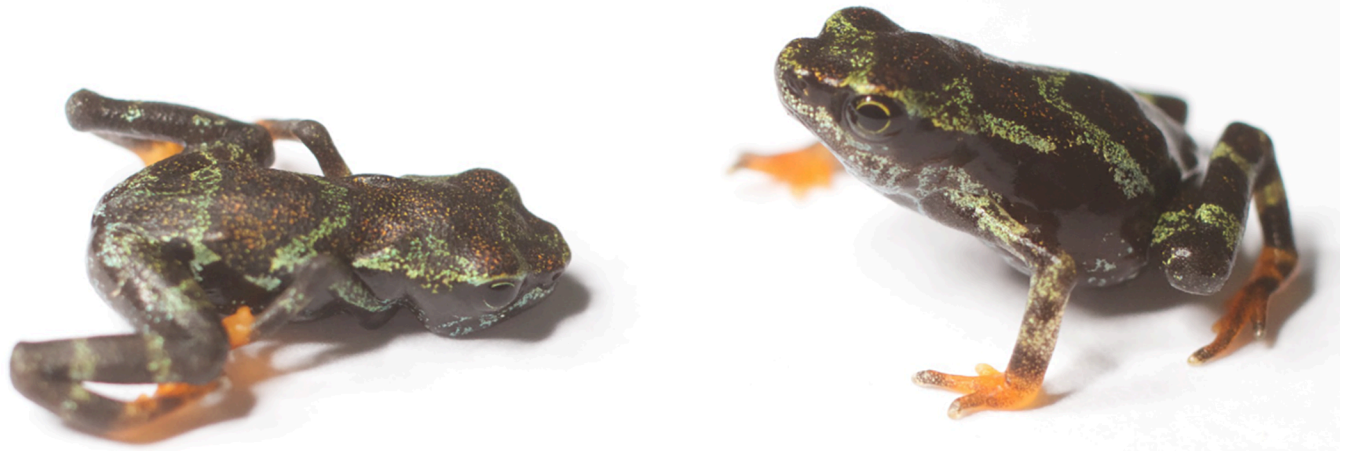
Fig 1. Atelopus certus post-metamorphs, an example of a SLS frog with poorly developed forelimbs (left) compared with a healthy froglet from the same clutch (right).

https://doi.org/10.1371/journal.pone.0204314.g001