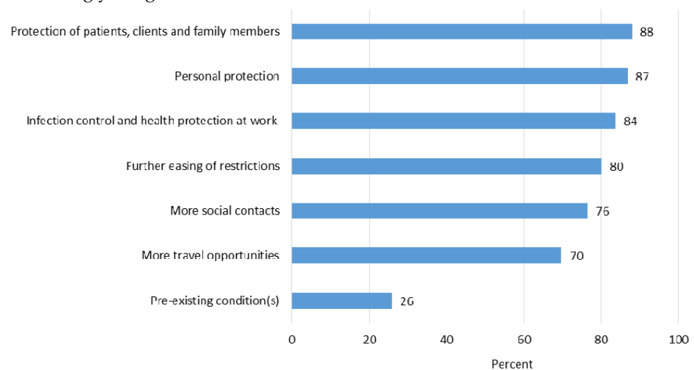
Figure 1. Reasons for COVID-19 vaccination (strongly agree/agree; percentage relative to the total sample).

In the second part, we asked about motivational reasons (7 statements) and reasons for refusal or hesitation (10 statements) to receive COVID-19 vaccination (see also Figures 1 and 2). The questions could be answered on a 5-point Likert scale from 1 = "strongly agree" to 5 = "strongly disagree".