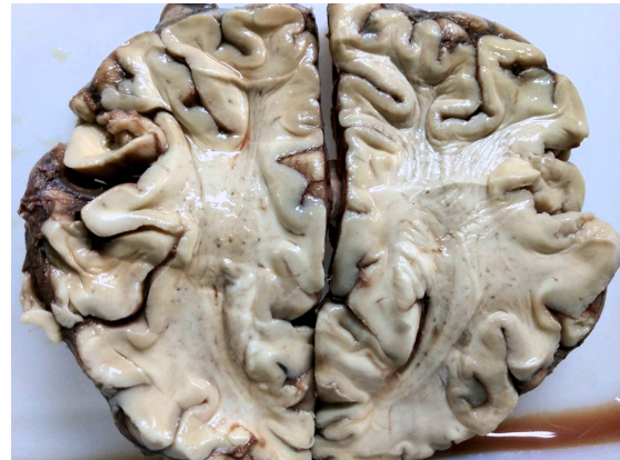
Figure 4: Brain autopsy, showing diffuse edema and congestion.

pain, leukocytosis and C-reactive protein elevation. Due to the suspicion of chorioamnionitis, the decision made was to terminate the pregnancy by misoprostol induction. After 2 days, the patient reported mild headache, neck stiffness and fever, with suspected retained products of conception. The uterine evacuation was accomplished with sharp curettage; intravenous piperacillin–tazobactam and vancomycin were initiated. Head computer tomography showed signs of diffuse cerebral edema and hydrocephalus and cerebrospinal fluid analysis ( Table 1 ) and showed protein elevation (49 mg/dl) with mild lymphocytic pleocytosis (five cells/mm 3 ). Cryptococcal antigen was negative. Meropenem and empirical treatment for tuberculosis with pyrazinamide, isoniazid, rifampin and ethambutol was initiated. Due to sensory deterioration, endotracheal intubation and mechanical ventilation were performed. Neurosurgery was consulted, and external ventricular drainage with monitoring of intracranial pressure was placed. An electroencephalogram was performed, which evidenced slow waves and reduced brain electrical activity.