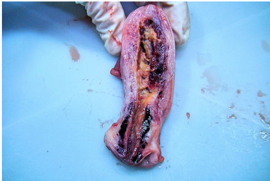
Figure 1: Macroscopic section of uterus showing increased size with evidence of necrosis.