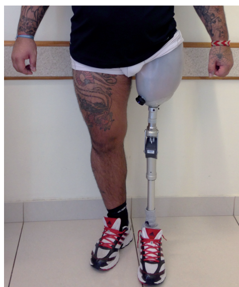
Figure 2. Patient standing with the definitive prosthesis.