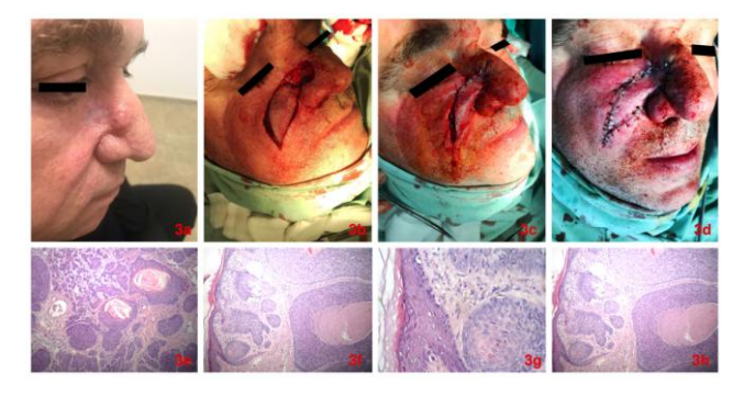
Figure 3: Island flap in patient with recurrent BCC. Similar to case 1 the the tumour lesion was removed, with a comparatively small field of surgical security in all directions. Then contouring of a triangle in the distal direction from the nose was performed, and the contours were gradually prepared to the musculature in depth (3b, 3c). This was followed by a transposition of the already prepared triangle to the ala nasi and a careful adaptation of the wound edges (3d). Histological evidence showed the presence of basal cell carcinoma with multifocal growth, maximum tumor diameter 12mm (Figs 3e-h)

A 56-year-old man is presented, with height 178 cm and weight 108kg, in a good overall condition. There is no evidence of family history. The patient was first admitted to the clinic for surgical removal of a tumorous formation in the nasal area. In 2006, the patient underwent a primary tumour surgery (a tumour was localised near the described one), and in 2014 there was a relapse, and the patient was operated again using advanced plastic surgery. Histological data showed that the patient had basal cell carcinoma resected in sano. Meanwhile, radiotherapy was also conducted.