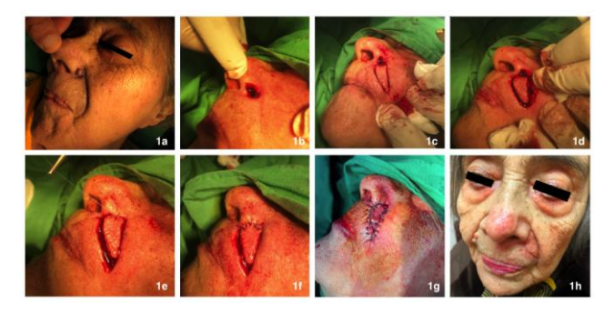
Figure 1: The lesion was removed in the form of the letter O, with a comparatively small field of surgical security of 0.3 cm in all directions. Then contouring of a triangle in the distal direction from the nose was performed, and the contours were gradually prepared to the musculature in depth (1c-d). This was followed by a transposition of the already prepared triangle to the ala nasi and a careful adaptation of the wound edges (1e-g)

An 82-year-old woman is presented, with height 156 cm and weight 49 kg, in a good overall condition. There is no evidence of family history, concomitant diseases and medication. The patient was first admitted to the clinic for surgical removal of a neoplasm that occurred approximately 2 years before, which gradually began to increase in the last few months. During the dermatological examination, we found a nodular formation on the left side of the nose, at the border with the nasolabial fold. The lesion had a rigid consistency, nodular, without a pearl edge, located immediately below the nasolabial fold, but at the same time involving the ala nasi on the left (Figure 1a).