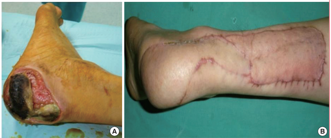
Fig. 7. Posterior tibial artery propeller perforator flap

(A) Calcaneal ulceration in a diabetic and atherosclerotic patient—preoperative aspect. (B) Long term result after covering with a peroneal artery propeller perforator flap based on a perforator found 5 cm above the lateral malleolus.