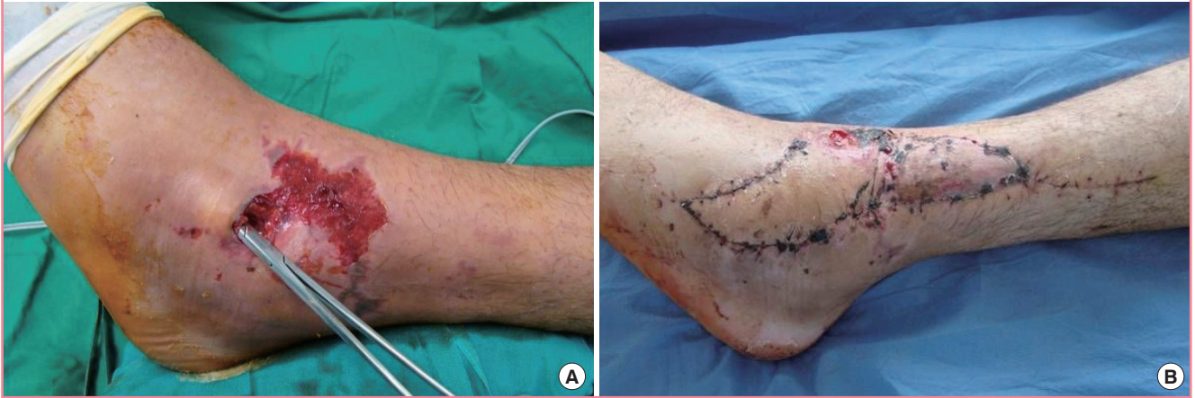
Fig. 6. Peroneal artery propeller perforator flap

(A) Posttraumatic defect over the peroneal malleolus in a young woman—the forceps indicates the extension of the lesion, with a distal pocket. (B) Final result, after covering the defect with a propeller perforator flap based on a very distal perforator of the anterior tibial artery; the donor-site was partially grafted.