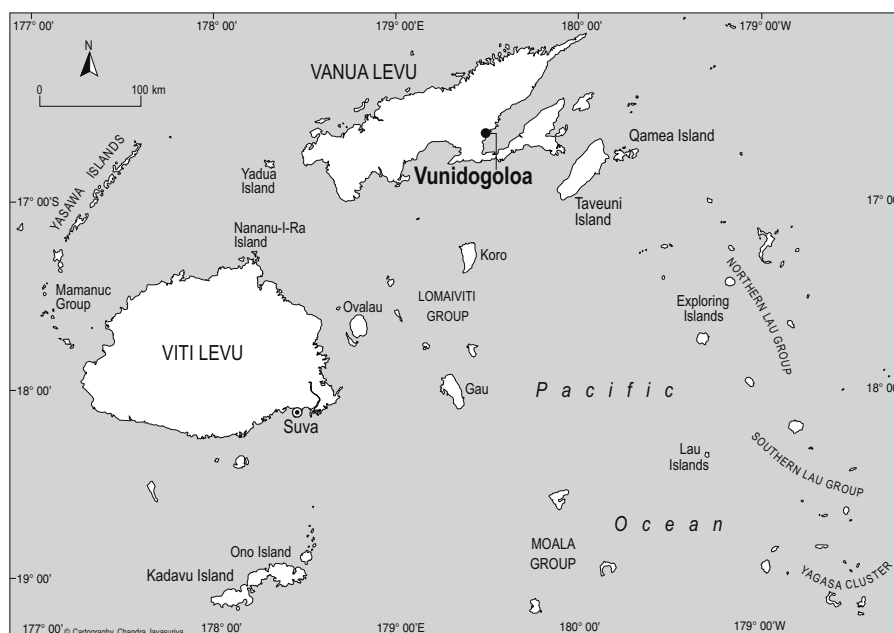
Fig. 1. Map of Vunidogoloa, Fiji (this map lists seven field-site from project, will remove all named sites other than Vunidogoloa).

The case studies were designed and conducted by the authors (Fiji - CM for blind review; Bangladesh - SAK; Burkina Faso - PNS), in collaboration with local and international researchers and community leaders. Data were collected from people aged \geq 18 years (age range 18–84), and participants with diverse backgrounds were included (e.g. age, gender, ethnicity, religion, class, migration histories, livelihood). The Fiji case study included qualitative interviews with 27 people (14 men, 13 women), four of whom participated in interviews across multiple points of data collection, and five key informants (local government, community health workers). In addition, six group discussions with between eight to twelve participants were conducted. All participants were iTaukei (Indigenous). The Bangladesh case study included in-depth interviews with 36 participants (2-3 interviews each), 16 key informant interviews (approximately 30 interviews), and 86 group discussions involving 700–1000 participants in total; the gender balance was fairly even. Interviews were conducted in homes, communal spaces (such as shared outdoor village areas, village halls) and some were walking