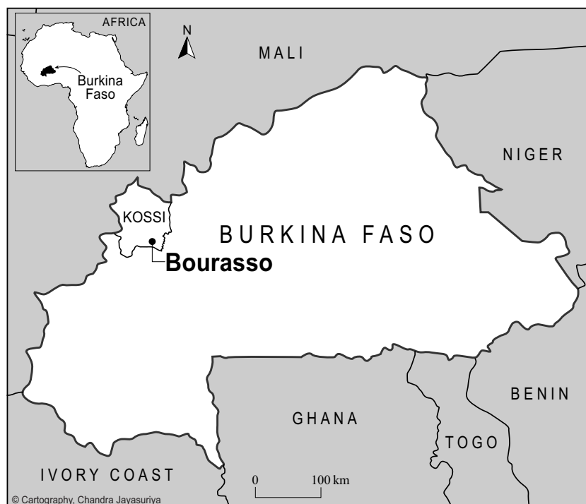
Fig. 2. Map of Bourasso, Burkina Faso.

interviews that enabled place-based conversation and observation. The Burkina Faso case study included 52 qualitative interviews with 30 migrant men who had recently returned to Bourasso, 18 migrant wives who remained in Bourasso, and four key informants (village leaders, local agricultural specialists (Table 1).