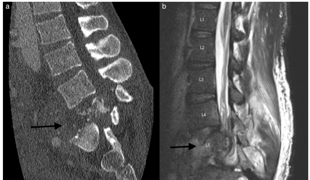
FIGURE 1: Preoperative CT and MRI of lumbar spine

(a) CT lumbar spine in the sagittal plan demonstrating L5 burst fracture. (b) T2 lumbar MRI in the sagittal plane demonstrating severe destructive process of L5 with extensive epidural and soft tissue enhancement concerning for infection.