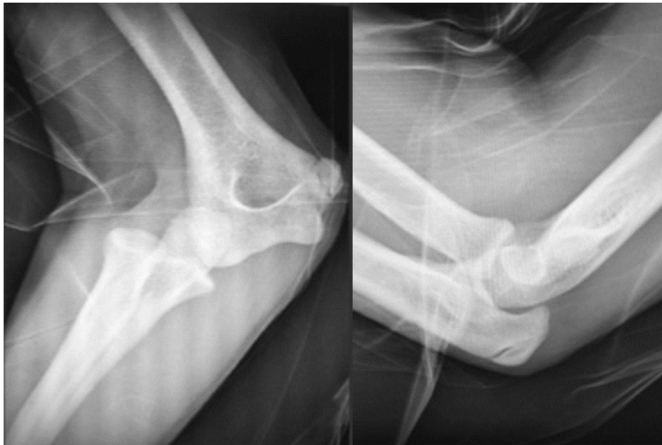
Figure 1 Anteroposterior and lateral radiograph of elbow showing incomplete pure left lateral elbow dislocation.