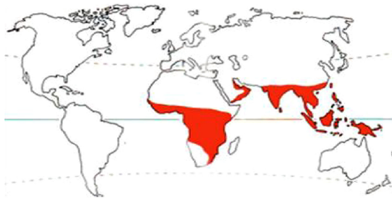
Figure 1 Showing the distribution of Chrysomya bezziana worldwide.

was hazy, and further detailed examination was not possible. Computed tomography (CT) scan of the orbit showed no signs of bone erosion or paranasal sinus involvement, except for the soft tissue swelling (Figure 3). The other eye was also examined for maggots and was found to be normal.