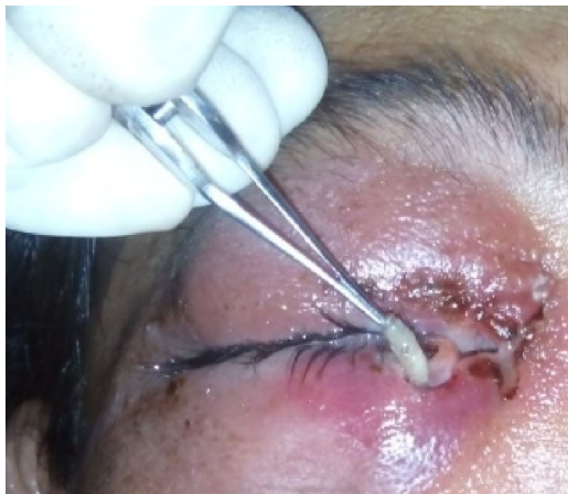
Figure 4 Mechanical removal of maggots with wound debridement.

There are 12 species in the genus Chrysomya , most of which are known to cause myiasis in animals. In the literature, only C. bezziana and Cochliomyia hominivorax have been implicated in causing ophthalmomyiasis in living humans. 8 The adult fly of Chrysomya is green or blue-green in color