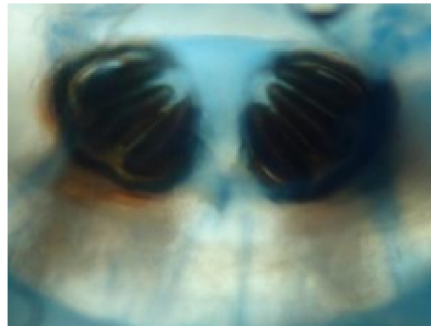
Figure 8 Incomplete posterior spiracular peritreme of Chrysomya bezziana .

and feeds on decaying matter, excreta, and flowers. Approximately 150–200 eggs at a time are laid by the female adult, on exposed wounds and mucous membranes of the mouth, ears, and nose. After 24 hours, eggs hatch, and larvae burrow deep into the living tissue in a screwlike fashion, completing their development while feeding on host tissue for 5–7 days. Thereafter they fall to the ground to pupate. The pupal stage is temperature-dependent, with sexual maturation in approximately 1 week to 2 months. Thus it takes 2–3 months to complete their life cycle. 9