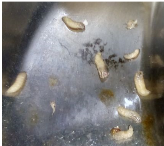
Figure 6 Maggots removed from patient's wound.