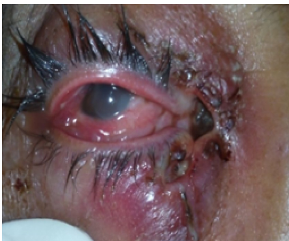
Figure 2 Lesion at the medial canthus, with free-moving maggots.

Turpentine oil packing was done to immobilize the maggots. Mechanical debridement of the wound was done, and freely moving maggots were removed with the help of forceps, under local anesthesia using 4% xylocaine (Figure 4). Regular dressing of the wound was done, with removal of maggots, for next 4 days. The patient was treated with intravenous amoxicillin sodium/potassium clavulanate 1.2 gm given 8 hourly and ibuprofen 400 mg twice daily for 3 days, followed by oral amoxicillin/clavulanic acid 625 mg twice daily for 5 days. A single dose of albendazole 400 mg tablet was also given. Local application of moxifloxacin 0.5% ointment to the right eye for 1 week was advised. The wound started to heal, with granulation tissue formation, and healing was completed by the end of 2 weeks (Figure 5).