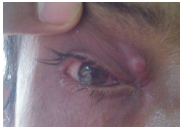
Figure 5 Follow up at 2 weeks, with completely healed wound.