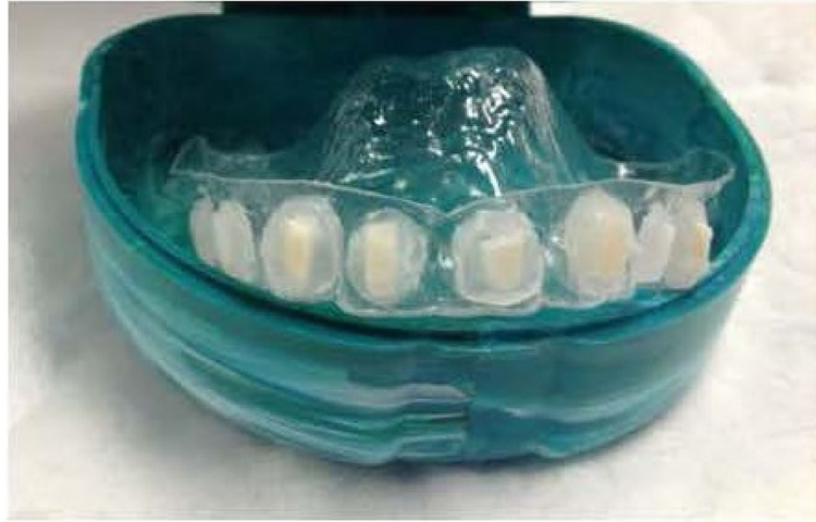
Figure 1. Oral appliance.