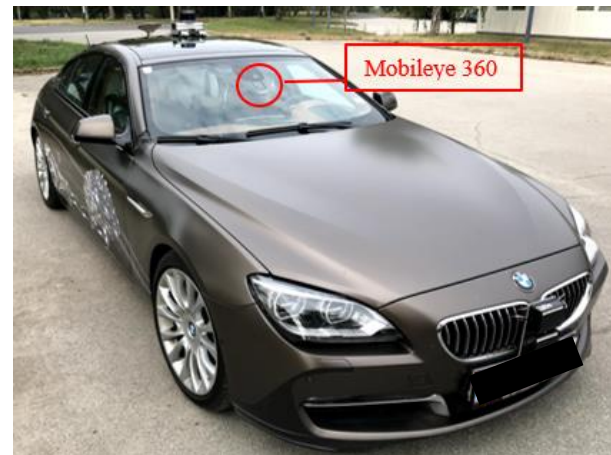
Figure 1. Testing vehicles equipped with measuring devices: dynamic retroreflectometer Zehntner ZDR 6020 (left) and Mobileye 360 (right).