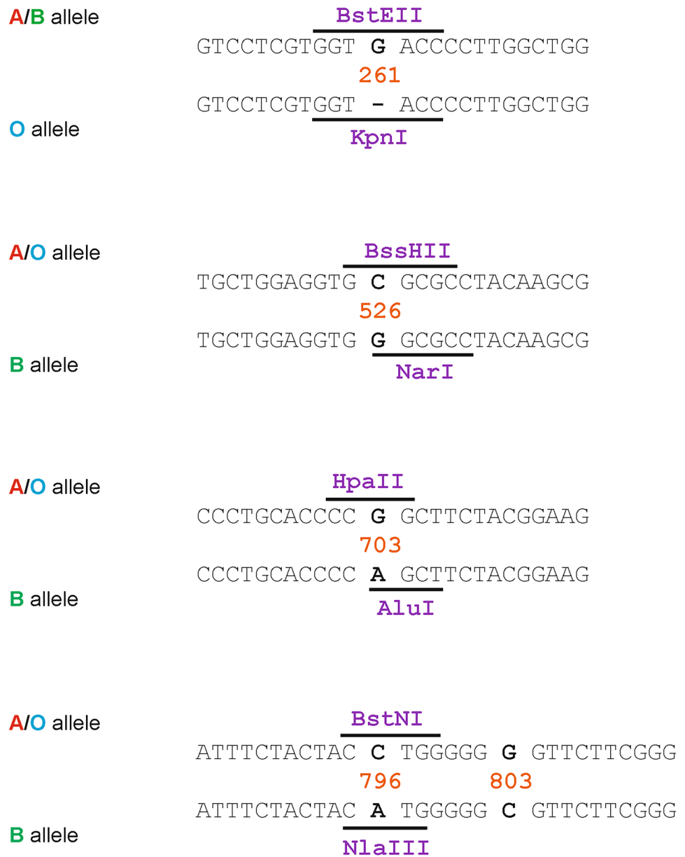
Fig. 2 ABO genotyping by allele-specific restriction fragment length polymorphism. ABO alleles with c.261delG and those without it can be discriminated by digestion with restriction endonucleases, KpnI and BstEII, respectively. Similarly, at positions 1, 2 and 3 of the 4 amino acid substitutions that discriminate AT and BT, A/O alleles and B alleles can be discriminated by cleavage by BssHII and NarI, HpaII and AluI, or BstNI and NlaIII, respectively

modifications have been applied to ABO genotyping over the past 30 years, and ABO genotyping is now routinely performed in immunohematology reference laboratories.