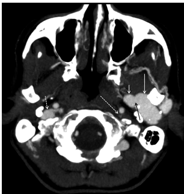
Figure 1. A 42-year-old woman with external carotid-external jugular AVF. Axial contrast-enhanced CT shows the fistula (black arrow) between the left external carotid artery (short white arrow) and the left external jugular vein (long white arrow) with associated dilatation of these vessels. The left internal jugular vein (long dashed arrow) is incidentally hypoplastic, as compared with the normal right internal jugular vein (short dashed arrow).