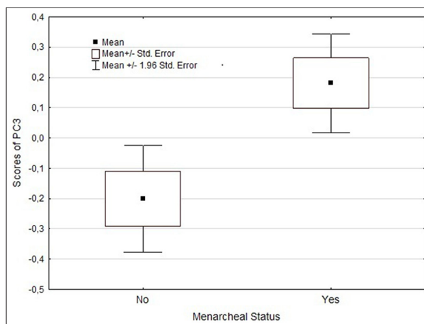
Figure 2: Mean, standard error, and standard deviation of the scores of principal components 3 among the pre- and post-menarcheal Bengali girls