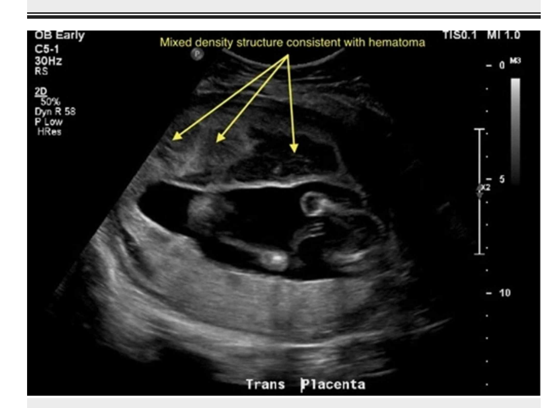
FIGURE 2: "U/S OB trauma limited" post motor vehicle collision, showing notable anterior echogenic material, which appears heterogeneous in echotexture with hypoechoic areas measuring 12.0 x 5.4 x 9.5 cm

U/S, ultrasound; OB, obstetric; findings were concerning for placental abruption.