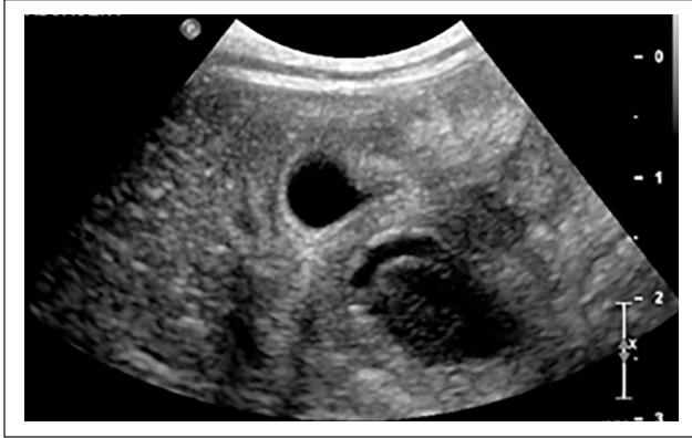
Figure 1 Abdominal ultrasound image. There is a large cavitated mass located dorsolateral to the gallbladder from an 8-year-old male neutered domestic shorthair cat