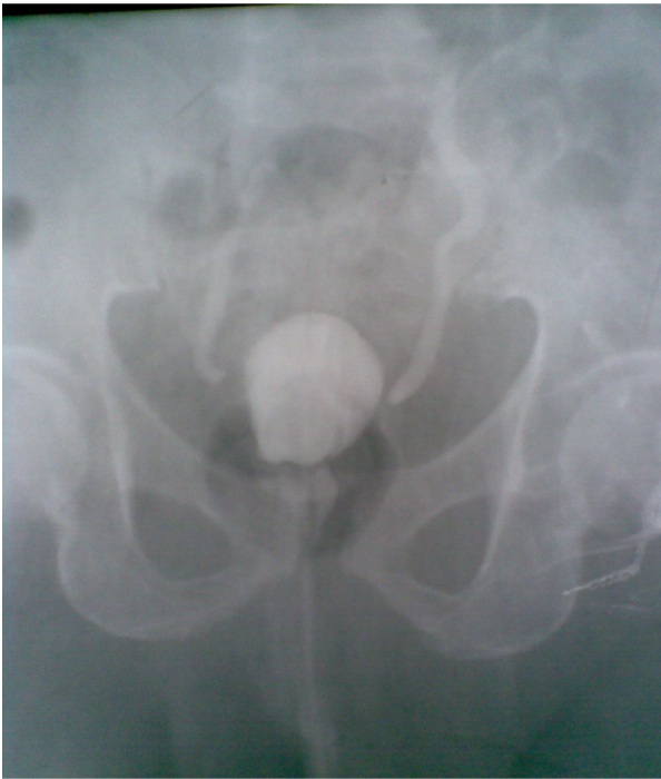
Figure 3 Postoperative bladder exteriorization cystogram.

meatal and submeatal stenosis (2.5%) and bladder neck contracture (0.35%). 7,8