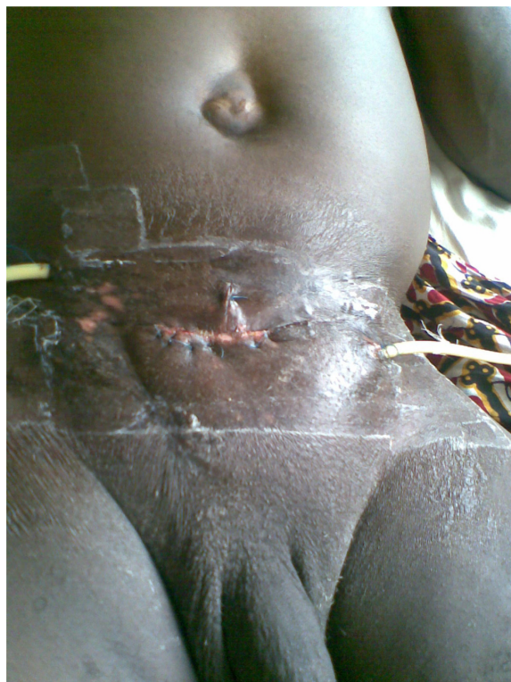
Figure 2 Postoperative closure of post open prostatectomy bladder exteriorization.

BPH is often indicated from filling and storage symptoms (irritative symptoms) and voiding symptoms (obstructive symptoms), also referred to as lower urinary tract symptoms (LUTS), together with acute urinary retention. Digital rectal examination often reveals a firm, smooth, enlarged prostate gland with a preserved median groove. Elongated verumontanum and occluding lateral lobes of the prostate seen in urethroscopy