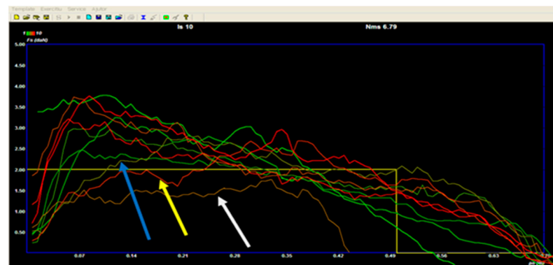
Figure 3. The visual-psychomotor scheme made without visual stimulus, Subject L. M.

When testing T2, the difference from T1 was that the subjects received the information that the executed movement must draw a line as close to the model (Figure 3—yellow graph) 10 times. They did not receive any explanation as to how the movement should be done (how hard or slow to pull or how to reach their arms).