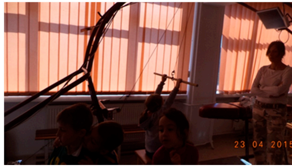
Figure 2. Execution with visual stimulus, ERGOSIM.

When testing T2, the difference from T1 was that the subjects received the information that the executed movement must draw a line as close to the model (Figure 3—yellow graph) 10 times. They did not receive any explanation as to how the movement should be done (how hard or slow to pull or how to reach their arms).