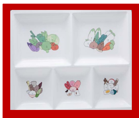
A. Portion control plate (Healthy plate)

group discussion with the RD. In particular, over time, the RD reviewed food choices, consistency and timing of meals, meal plans and appropriate use of snacks, in addition to portion control (i.e. how to use the healthy plate). The healthy plate is made of pottery and porcelain with colorful print dividing it into four sections (Figure 2). It is 27.4 cm long, 21.0 cm wide and 2.5 cm deep. Three-sixths (one-half) of the plate was labeled "vegetables", one-sixth was labeled "rice, bread and noodles" and two-sixth were labeled "fish, meat, chicken and nuts". One section was similar to 1 unit (= 80 kcal) of