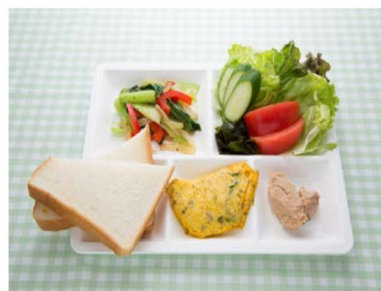
C. Western-style dishes (450kcal)