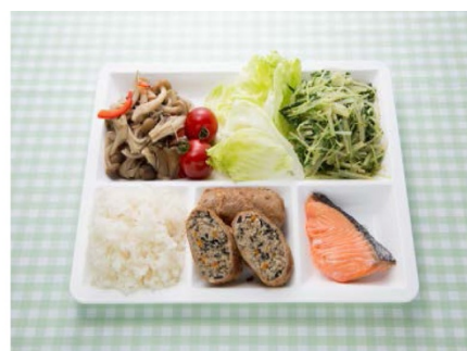
B. Japanese-style dishes (460kcal)