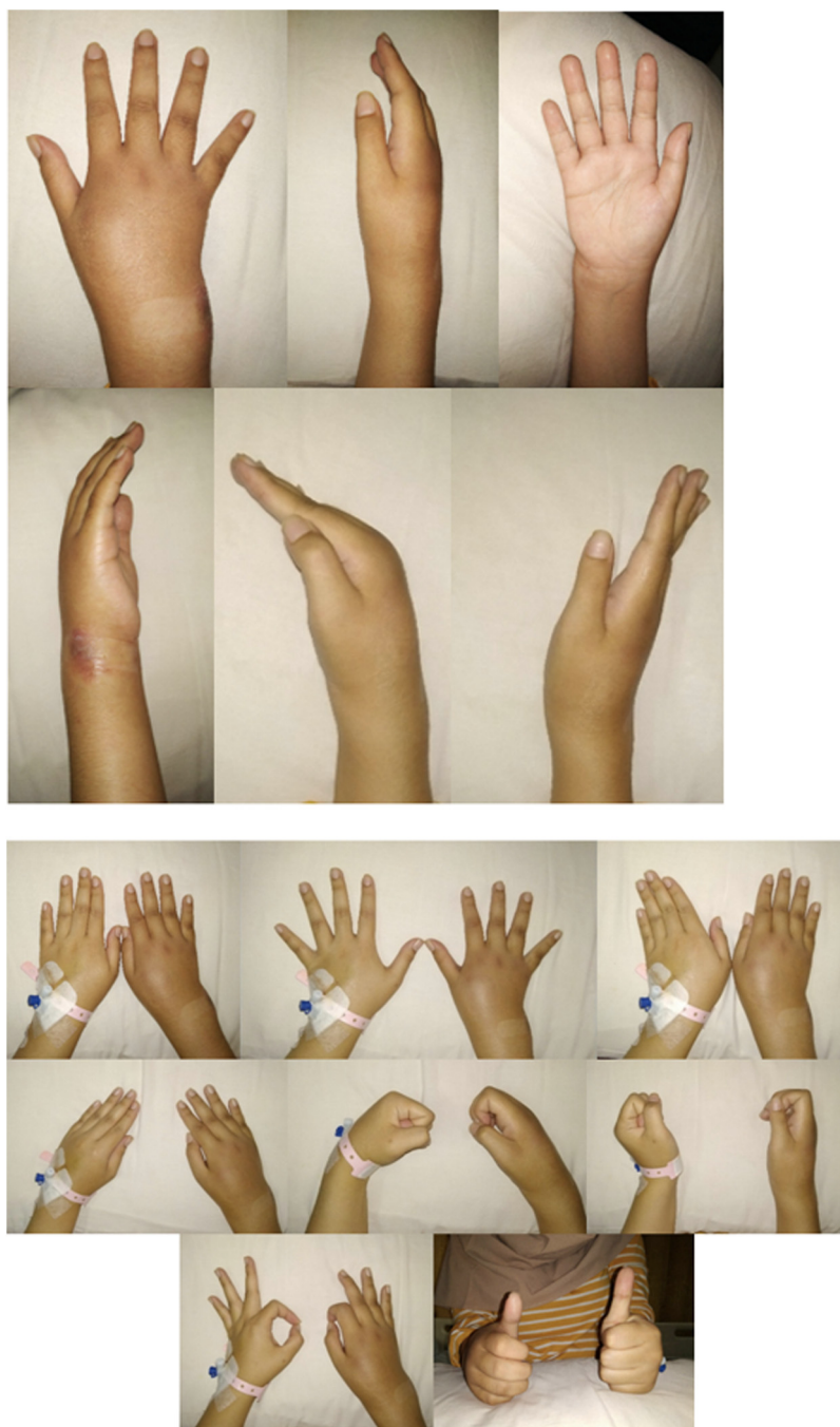
Fig. 1. Clinical manifestation of the Patient.

but was decreased on the right wrist. The range of motion of the finger was limited due to pain.