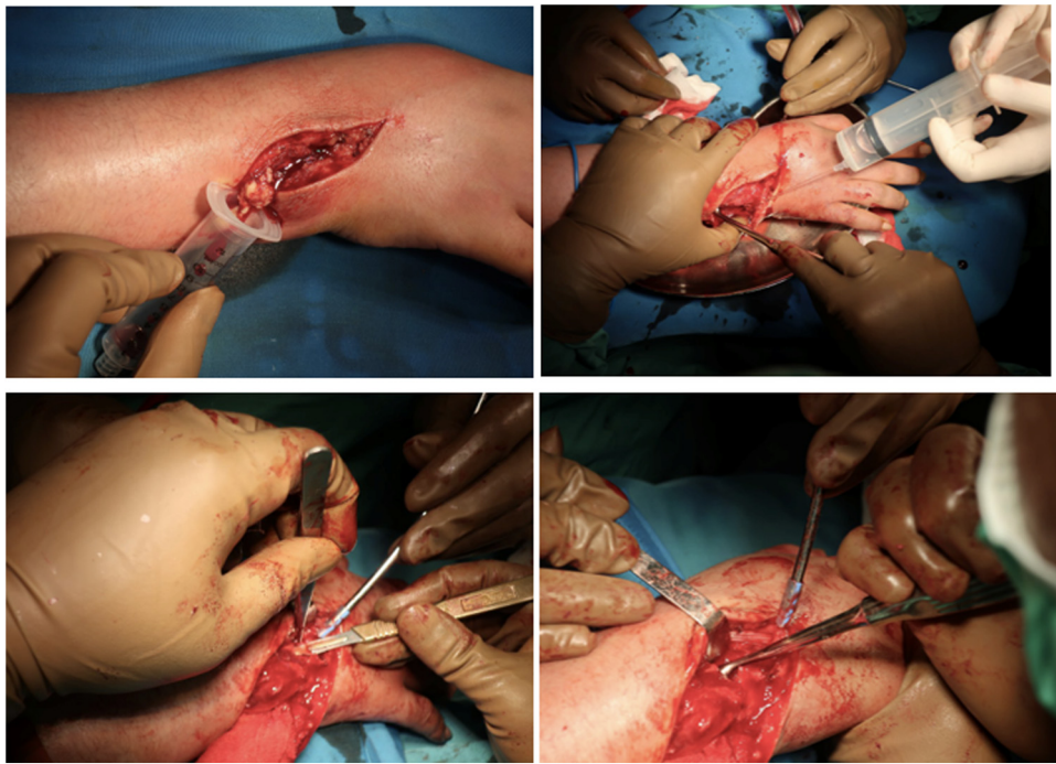
Fig. 4. Intraoperative Procedures.