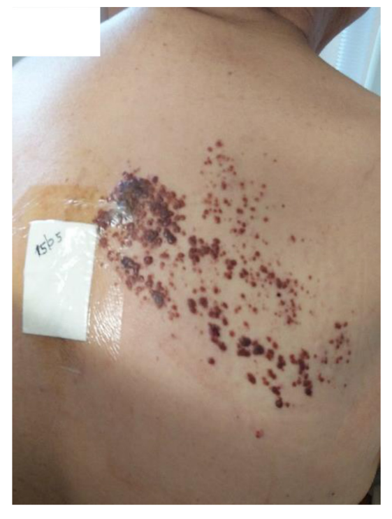
Figure 1 Clinical presentation of multiple seborrheic keratoses on the right posterior thoracic region.

On admission to the emergency department, she was polypneic with signs of respiratory distress, tachycardic, normotensive and afebrile. Chest