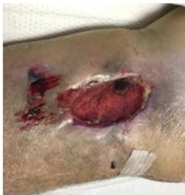
Fig. 2 Open wound after left knee arthroplasty.

Risk factors for this infection include immunocompromised status, obesity, diabetes, rheumatoid arthritis, smoking history, prior surgeries, or prior administration of corticosteroids. 1,3-5,7-9 Clinical presentation often involves fatigue, red-