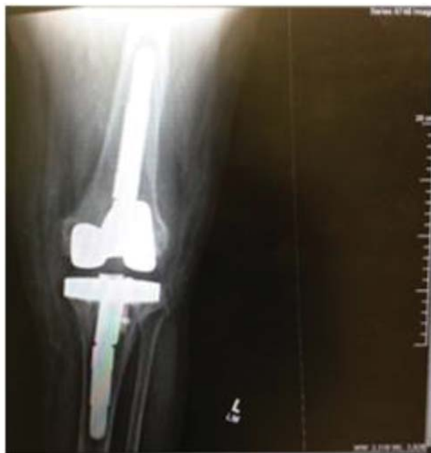
Fig. 1 X-ray: lateral view of the insertion of a spacer postsurgery of the left knee.

patient was given rivaroxaban for deep vein thrombosis prophylaxis and was placed in long-term acute care.