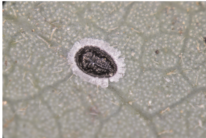
Figure 1: Tetraleurodes perseae pupa, showing the dark pupa with marginal white wax fringe which are characteristic for many of the species in the Tetraleurodes genus