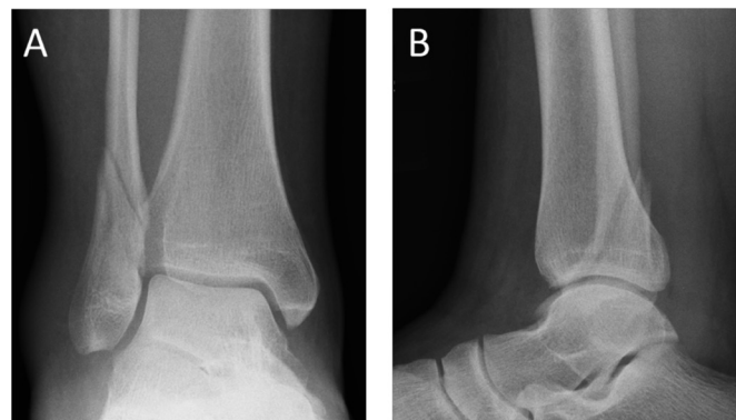
Figure 1 Weber B-type fibular fracture with reduced ankle mortise.