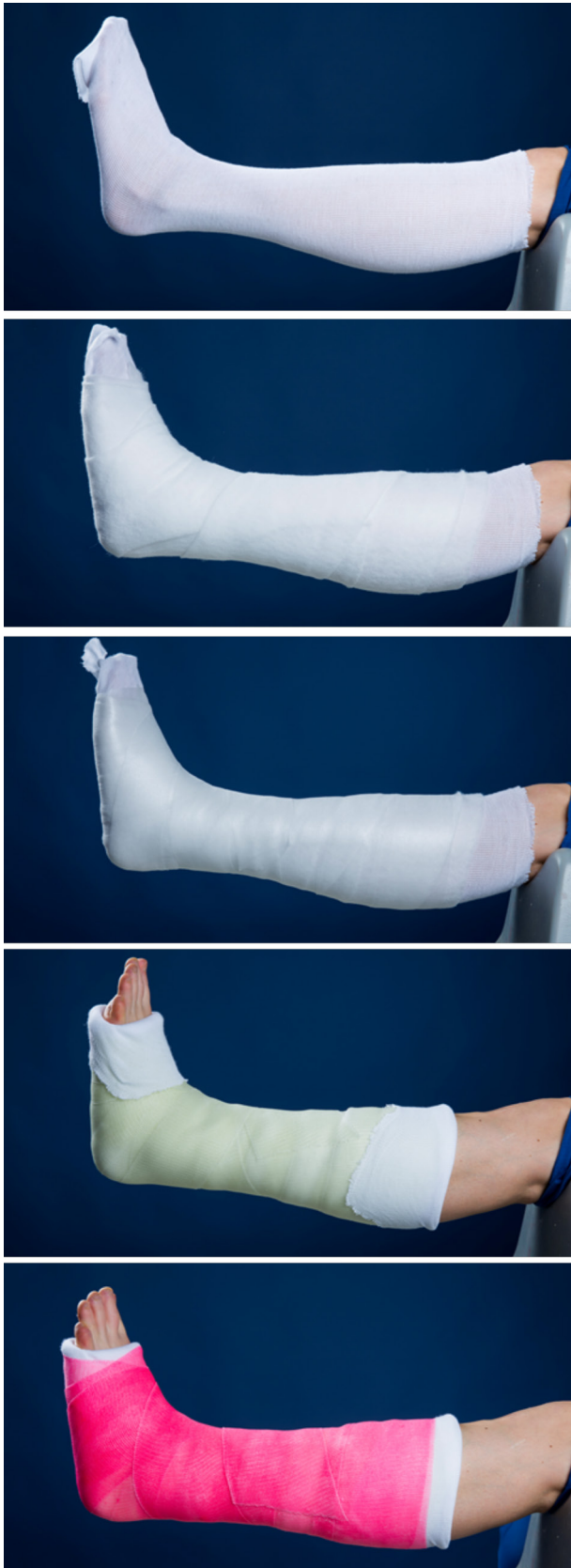
Figure 3 A standard, padded below the knee synthetic cast made by a trained plaster technician. Cast is applied from the tuberosity of the tibia to the base of the toes and is lined and padded. The cast is applied with the ankle joint placed at 90° angle (neutral dorsiflexion).

neutralization or antiglide 1/3 semitubular plate. The use of tourniquet was left at the discretion of the operating surgeon. All surgeries were performed during the office hours by experienced orthopedic trauma surgeons or by orthopedic residents under the direct supervision of an orthopedic trauma surgeon. Wounds were closed in two layers with the skin closed either using stitches or staples. Unless major swelling or wound bleeding, all operated ankles were placed on a below-the-knee cast identical to the non-operative group on the first post-operative day. The guidance on walking with crutches and the instructions on weight-bearing were identical to the non-operative group.