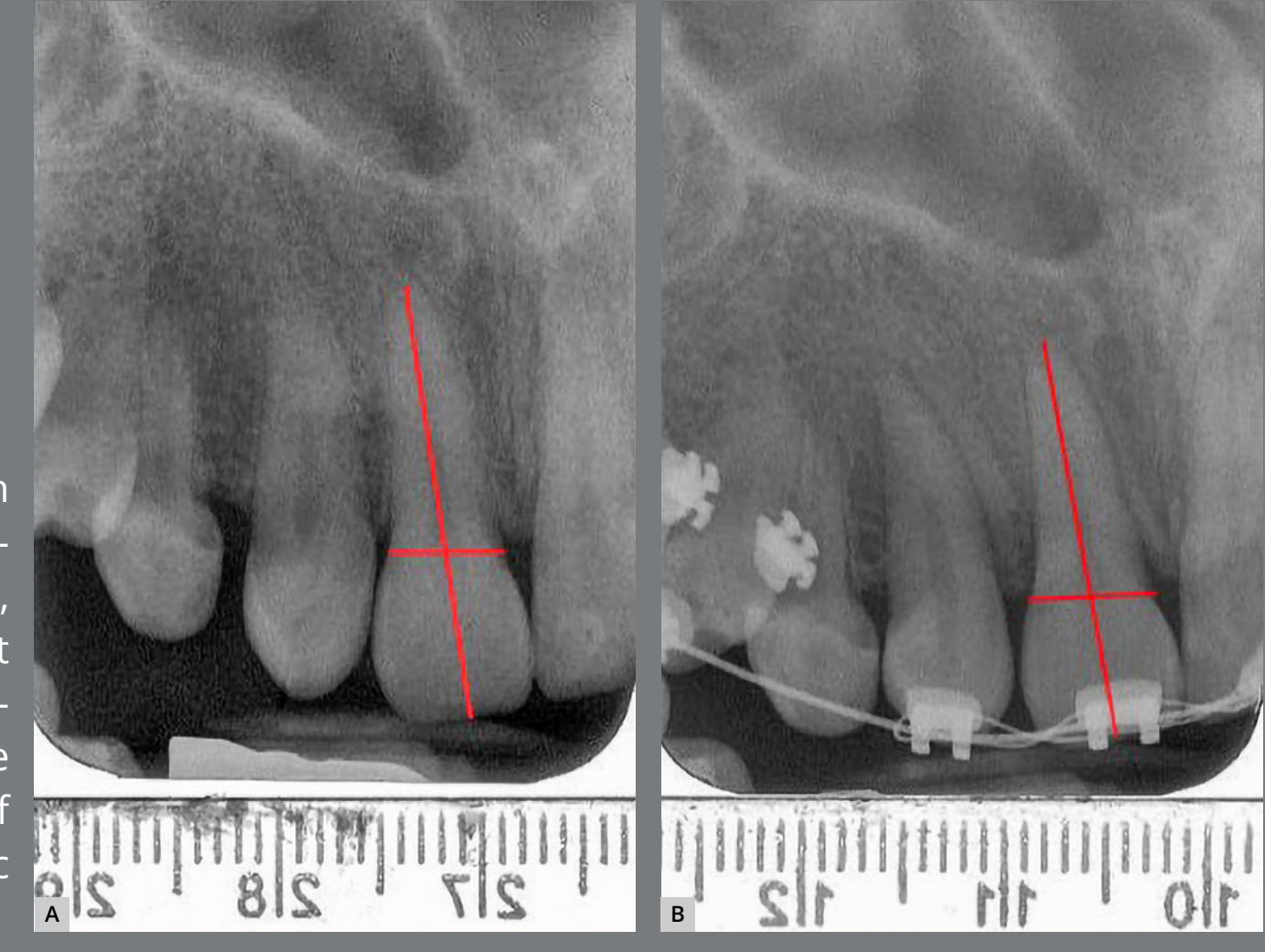
Figure 1: Evaluation of EARR: A) Point selection on an incisor, at the treatment onset; B) Point selection on the same tooth, at the end of fixed orthodontic treatment.