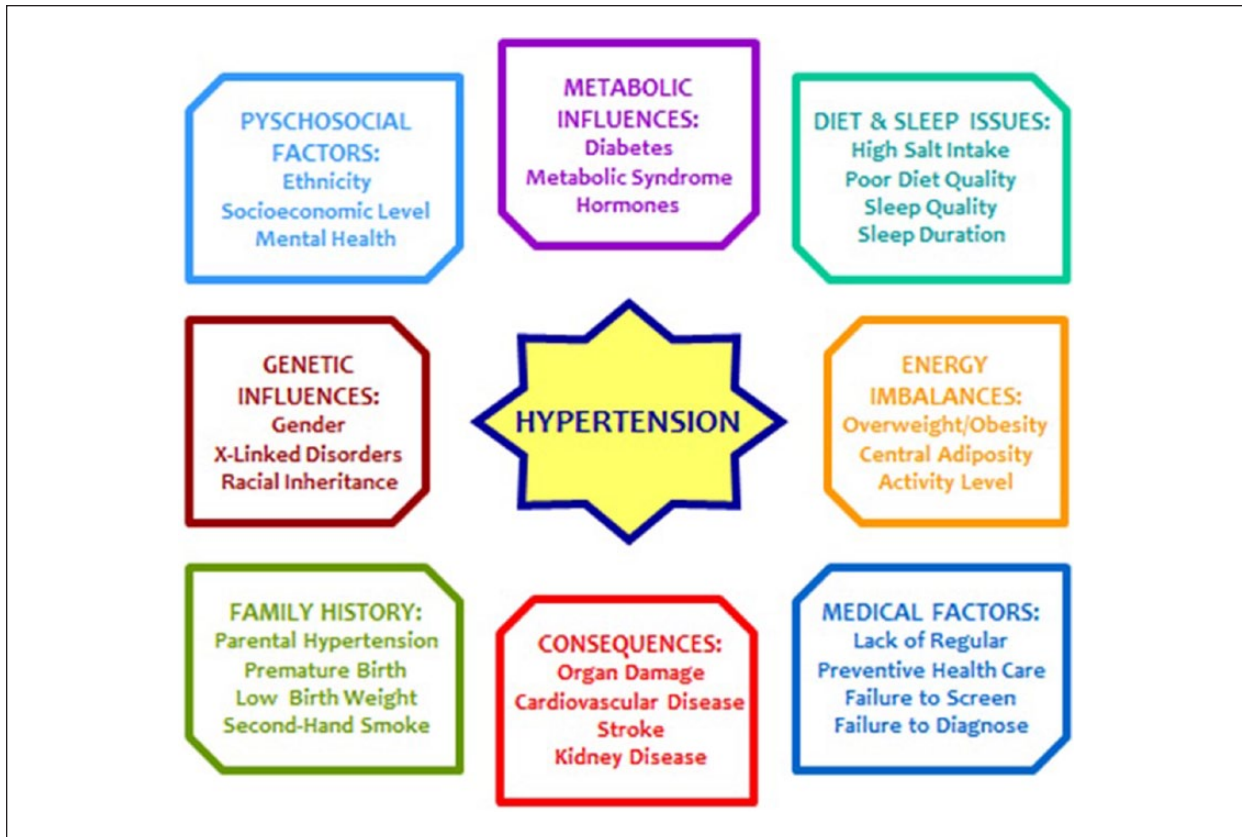
Figure 1. The many interrelated factors that influence hypertension in adolescents, and some of the serious consequences that result from delayed diagnosis and treatment.

between 2% and 5%, and the prevalence of prehypertension is estimated at between 4% and 15%, 5,6 but studies in both the United States and Europe have found that only 13% to 26% of childhood hypertension is properly diagnosed. 1,2,7-9 Children with primary hypertension may be asymptomatic or the symptoms may be mild and seemingly unrelated, such as changes in behavior or school performance, nosebleeds, headaches, or shortness of breath. 10