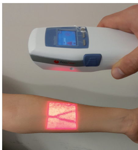
Fig. 1: Demonstration of the VVD application for the detection of superficial veins in the arm.

Damage to the palatal neurovascular bundle (NVB) which comprises greater palatine artery, vein and nerve together may lead several complications during the surgery (3). NVB injury may result in post-operative palatal paresthesia (4). Additionally, perforation of the blood vessels may lead excessive bleeding as well. The management is a disturbing and time-consuming process which may lead completion of the procedure with poor treatment outcomes (5). The possibility of this hemorrhagic complication may limit clinician from harvesting the optimum sized grafts required for the treatment demands (6). Direct pressure to the bleeding site, topical administration of hemostatic agents, laser applications, electro-surgery and suturing were suggested to be beneficial for obtaining hemostasis to some extent (7). Considering the above mentioned complications, prevention from this injury is a crucial concern in palatal graft harvesting surgery. Numerous cadaver and radiological studies suggested "safe" distances from the adjacent teeth to palatal vessels to guide clinicians for the determination of surgical borders of palatal donor sites during the graft harvesting (3,8-11). However, considering the anatomical variations use of these morphometric reference distances is not valid for each individual (4). Recent advances in the medical imaging devices allow real-time visualization of superficial veins under the skin (12) (Fig. 1). A laser assisted near-infrared vein