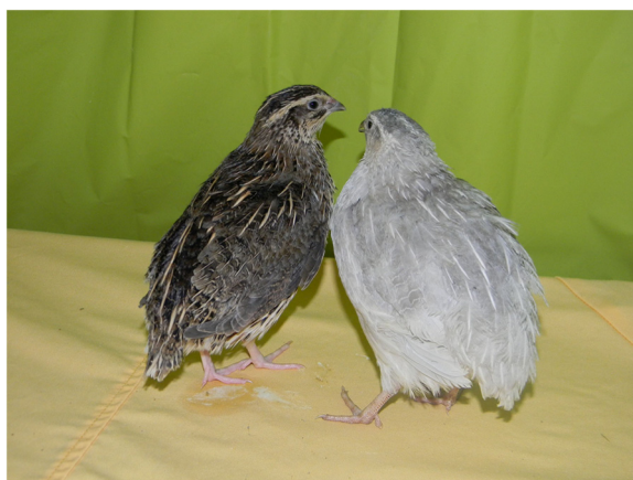
Figure 1 Wild-type (left) and lavender (right) Japanese quail.

All Japanese quail were produced and maintained at the INRA Experimental Unit PEAT in Nouzilly, France (Pôle d'Expérimentation Avicole de Tours, F-37380 Nouzilly, authorization B37-175-1, 2007) in accordance with European Union Guidelines for animal care, under authorization 37-002 delivered to D. Gourichon by the French Ministry of Agriculture. Animal procedures were