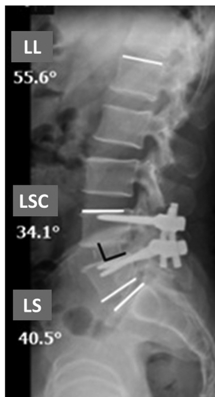
Fig. 1 Lateral spine radiograph demonstrating the angular measurements after cage introduction. LL, lumbar lordosis; SLC, segmental lordosis of the cage; SL, segmental lordosis.

We evaluated preoperative and postoperative lateral radiographs in orthostasis using the Surgimap (Surgimap, Nova York, NY, EUA) software to obtain sagittal alignment parameters. The measurements were the following: LL – Cobb angle formed by the superior vertebral plateau of L1 and the sacral line (S1); segmental lordosis (SL) – Cobb angle formed by the superior plateau of L4 and the sacral line (S1); and segmental lordosis of the cage (SLC) – Cobb angle formed by the superior plateau of the superiorly fused vertebra and the